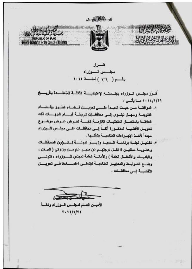
2012 and 2014 communications of the Iraqi council of ministers in regards to the creation of the new administrative units and three new governorates, including the governorate of Nineveh Plain.

Why do you think the US and the coalition countries protected the Kurds and the Kurdish region from ISIS (Obama’s Red Line), but allowed the destruction of Assyrian archaeological sites in Nineveh province, allowed the destruction of the Nineveh Plain Assyrian towns, allowed the destruction of the Assyrian quarters in Mosul, allowed the invasion of the Assyrian Khabor villages and the strong Assyrian quarters in Aleppo, but opened their doors quickly to thousands of Assyrians to settle in those four countries?